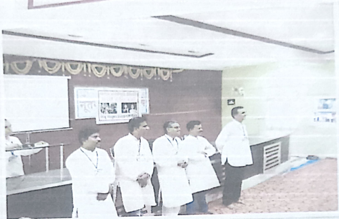
Election Tribe Pathways Presentation